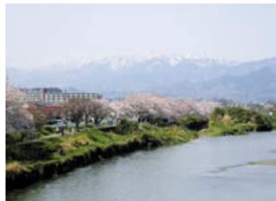
Chery blossoms on the bank of Hanamizu River

The suburban area of Hiratsuka City is located along Kaname river and Oiso hills. Active agriculture is managed here and traditional scenery and diverse natural environment are reserved.