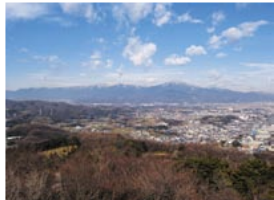
Scenery from Shonandaira

The central part of Hiratsuka City lies on old dunes. In the Edo era, there was a posting town for the Tokaido trail. Now this area is urbanized and many people live here. There are also many buildings, shops and factories.